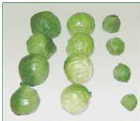
AGGRAND AGGRAND Plus* Miracle Gro®

Miracle Gro® was applied to the media every two weeks just like the AGGRAND treatments. Three ounces of the AGGRAND 4-3-3 Natural Fertilizer were mixed with one gallon of water to be applied to the media and to the leaves. For the Miracle Gro® treatments, one teaspoon of fertilizer was mixed with one gallon of water and applied to the media as stated in the directions. For the banded treatment at planting, two ounces